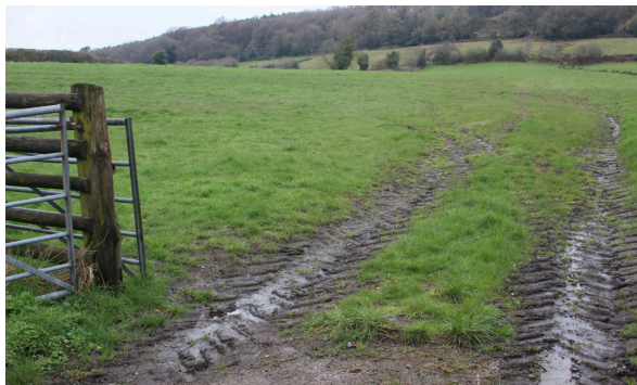
The Wolds site from Gritstone Road

There is no short cut to doing this, but you can have your say NOW, by completing the Council’s survey at www.derbyshiredales.gov.uk/LocalPlan