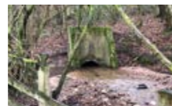
Culvert almost blocked with sediment

The stream predates all the housing and follows the bottom of the valley from south of Old Derby Road. It marks the Ashbourne Parish boundary on the south western side. It flows under Wyaston Road via a culvert (near the flyover) then to the south of the A52 bypass, crossing back under the A52 to emerge behind Highfield Road. A final culvert takes it under Clifton