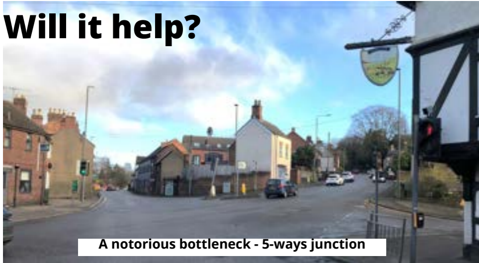
A notorious bottleneck - 5-ways junction