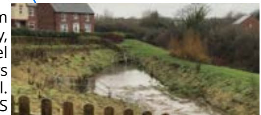
This serves Ramblers Gate and outfalls into the stream before the culvert

However some SuDS don't seem to be behaving correctly, appearing to have the same level of water all the time. Others seem to collect no water at all. These observations of the SuDS have occurred alongside examples of flooding events and this suggests that all may