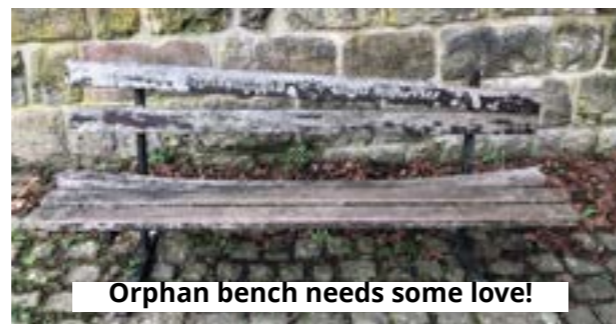
Orphan bench needs some love!