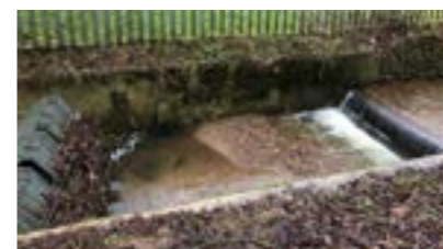
Gravel trap and trash screen by Clifton Road culvert

The stream predates all the housing and follows the bottom of the valley from south of Old Derby Road. It marks the Ashbourne Parish boundary on the south western side. It flows under Wyaston Road via a culvert (near the flyover) then to the south of the A52 bypass, crossing back under the A52 to emerge behind Highfield Road. A final culvert takes it under Clifton