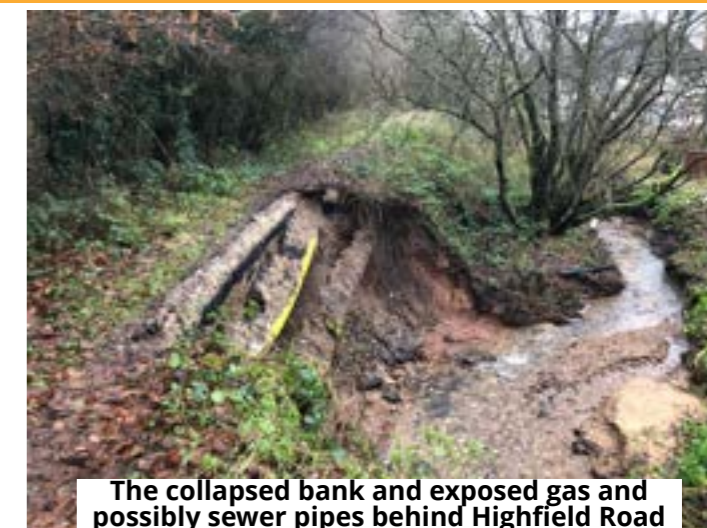
The collapsed bank and exposed gas and possibly sewer pipes behind Highfield Road

One stream (with no official name) flows through three culverts that take the stream underneath roads. Its flow under normal conditions appears to be little more than a trickle. Yet recent weather events that have coincided with blocked 'trash screens' on the entry to two of the culverts appear to have caused flooding that has caused damage and loss of trade with cars written off and shops closed. What went wrong?