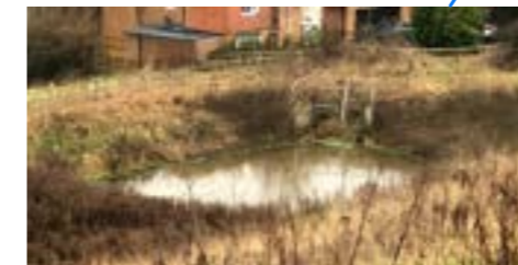
This pond serves Henmore Gardens but outfalls into the Premier Av storm water sewer

the water from extreme downpours, with the pond filling up and then slowly draining away safely.