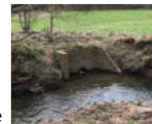
The stream joins the Henmore

Road before it discharges into the Henmore at a bend in the river, behind Homebase. There is evidence that the stream is carrying a