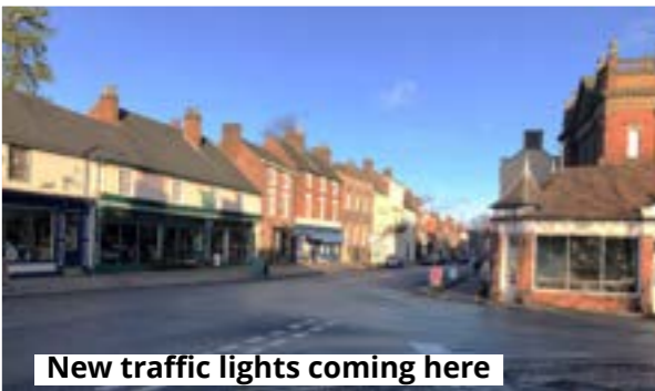
New traffic lights coming here

Ashbourne has, it appears, been chosen to have an extra set of traffic lights at the Station Road - Church Street junction