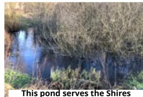
This pond serves the Shires estate. It is however full of trees!

One of the problems that we face as climate change shifts our winters towards 'warm, wet and windy' is how to cope with heavier rainfall, especially in urban areas. With more hard surfaces, as fields become built upon, there is a greater volume of rain water that needs to be safely dealt with. One of the strategies introduced in recent times is the requirement for a developer to have a suitable