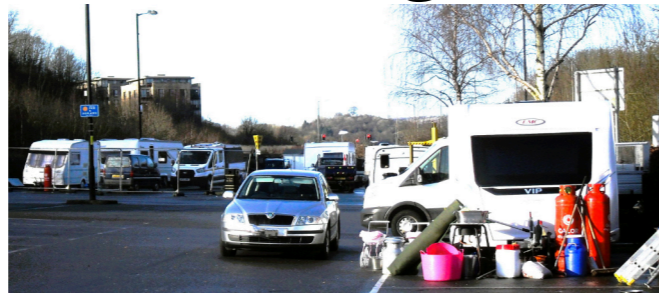
Some of the caravans on Station Car Park Matlock

A hopeful sign was the Council's unanimous support for a package of measures designed to provide a detailed framework for the future selection of traveller sites, including consultation and a defined set of criteria for