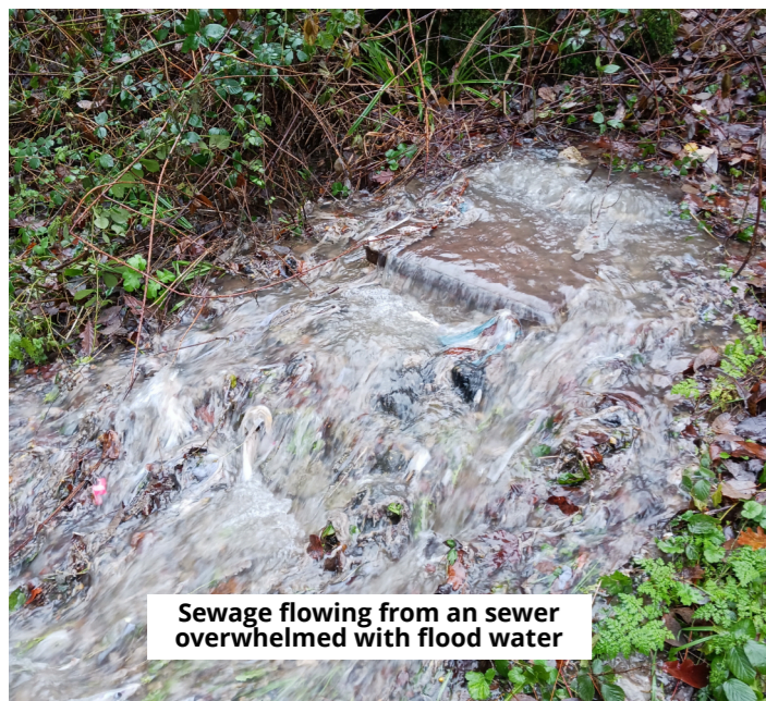
Sewage flowing from an sewer overwhelmed with flood water

In the recent Chancellor's Autumn Statement was an 11% cut in the new Environment Secretary's budget, impacting directly on Government attempts to deal with the sewage scandal. This is something we are familiar with in parts of Matlock, especially Lumsdale, a range of properties below the Treetops development and at Matlock Green.