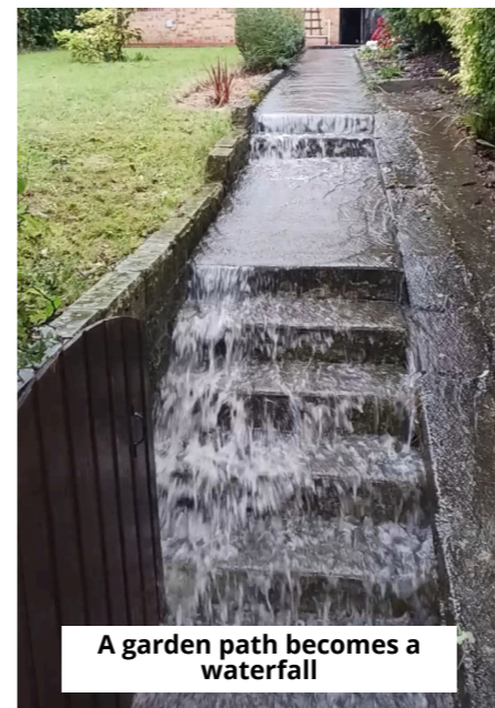
A garden path becomes a waterfall