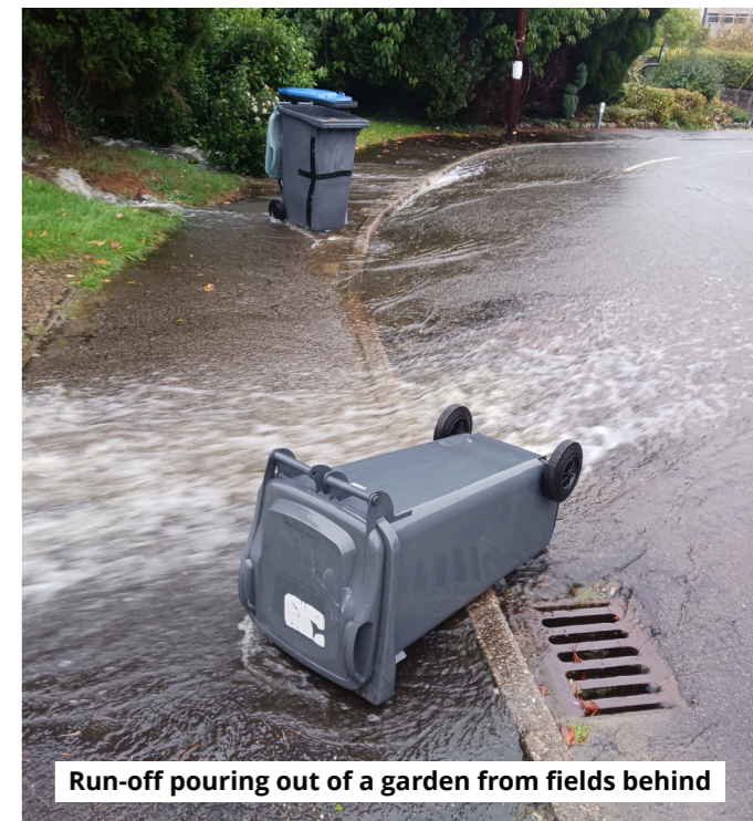
Run-off pouring out of a garden from fields behind

The new Local Plan will have a role in this – it needs to be better than its predecessors, in order to stop inappropriate housing and make sure local residents get a say through meaningful consultation. We also call on the County Council as Lead Local Flood Authority to overhaul the way it judges flood risk".