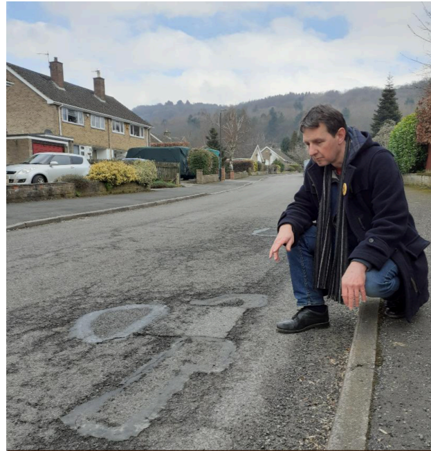
Don't forget to report your potholes to https://bit.ly/3vtzgAV