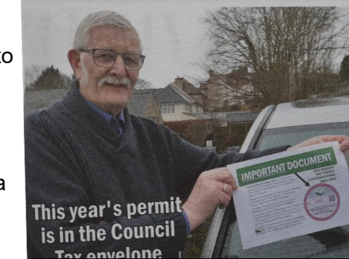
This year's permit is in the Council Tax envelope