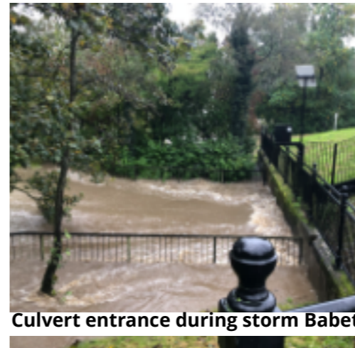
Culvert entrance during storm Babet

Storm Babet caused significant problems across the region with roads closed and houses flooded. Considering that the Henmore Brook reached a height of 1.93m at the gauge behind the hospital (it is normally about 0.2m) Ashbourne escaped with less flooding than might have been anticipated, thanks to some swift and effective action by volunteers in the town centre.