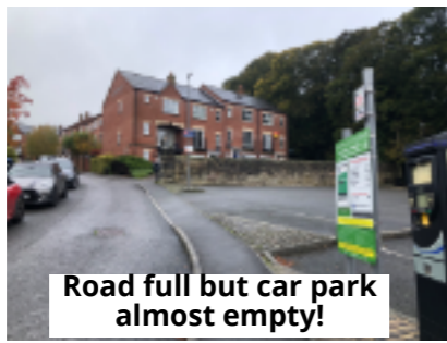
Road full but car park almost empty!

Lib Dem Councillor for Ashbourne South, Rob Archer , who is a member of the Car Park Working Group, comments; "I have been pressing for a change in when the resident's permit can be used from after 4pm to after 3pm. This should help parents collecting their children from school, allowing them to park in Shaw Croft car park for free using their DDDC permit." The group has also been discussing the idea of giving under-used car parks a different pricing structure to encourage their use and reduce the number of cars parking on residential roads. These cars can often cause a significant hazard for both pedestrians and other road users.