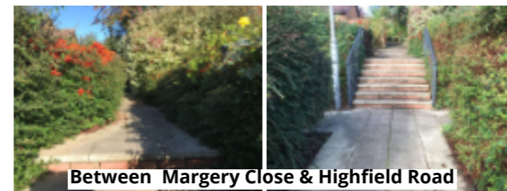
Between Margery Close & Highfield Road