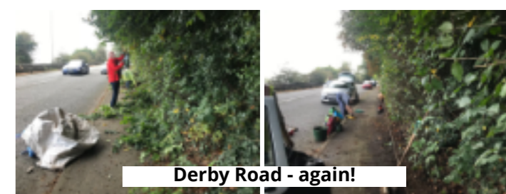
Derby Road - again!

Liberal Democrats - keeping you in touch all year round