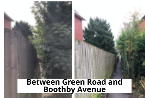
Between Green Road and Boothby Avenue

Step up 'Proud of Ashbourne' . In addition to their work in litter picking, this group of volunteers have taken on the task of clearing some of these pathways and the results have been impressive. Would you like to join them? Email action@proudoofashbourne.org if you are able to help, or would like to suggest their next project.