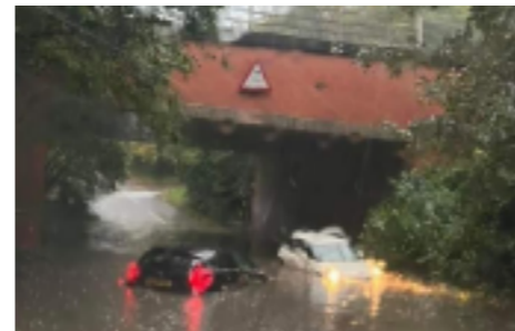
It's deeper than it looks. Wyaston Road during the storm

However that is no consolation for those that were flooded, with properties around the bridge on School Lane affected the most despite being almost at the edge of flood zone 2. Particularly distressing for the residents was the flooding of the Old Trust Spalden's Alms Houses. It will doubtless be a long clean up, after up to half a metre of water entered the homes, despite the efforts of the fire service and local residents.