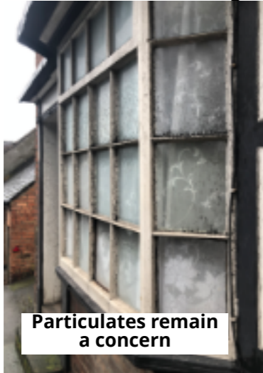
Particulates remain a concern